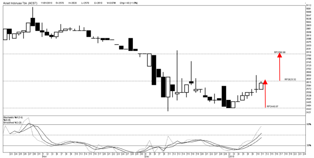
Kinerja saham ACST

Danareksa research report are also available at Reuters Multex and First Call Direct and Bloomberg